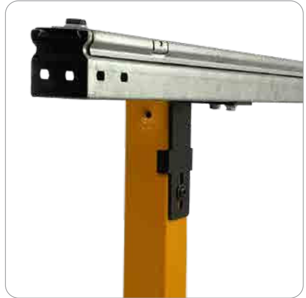
020P Support for cable duct