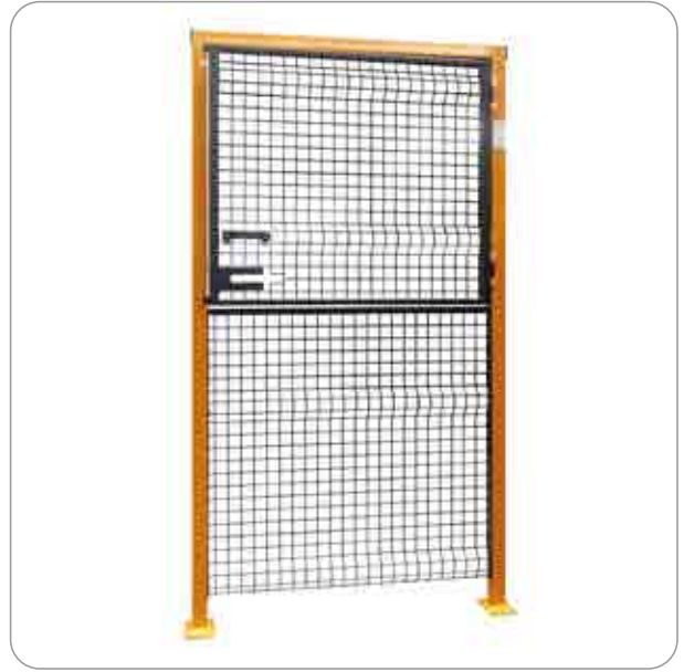
Gate with partial opening and fixed panel