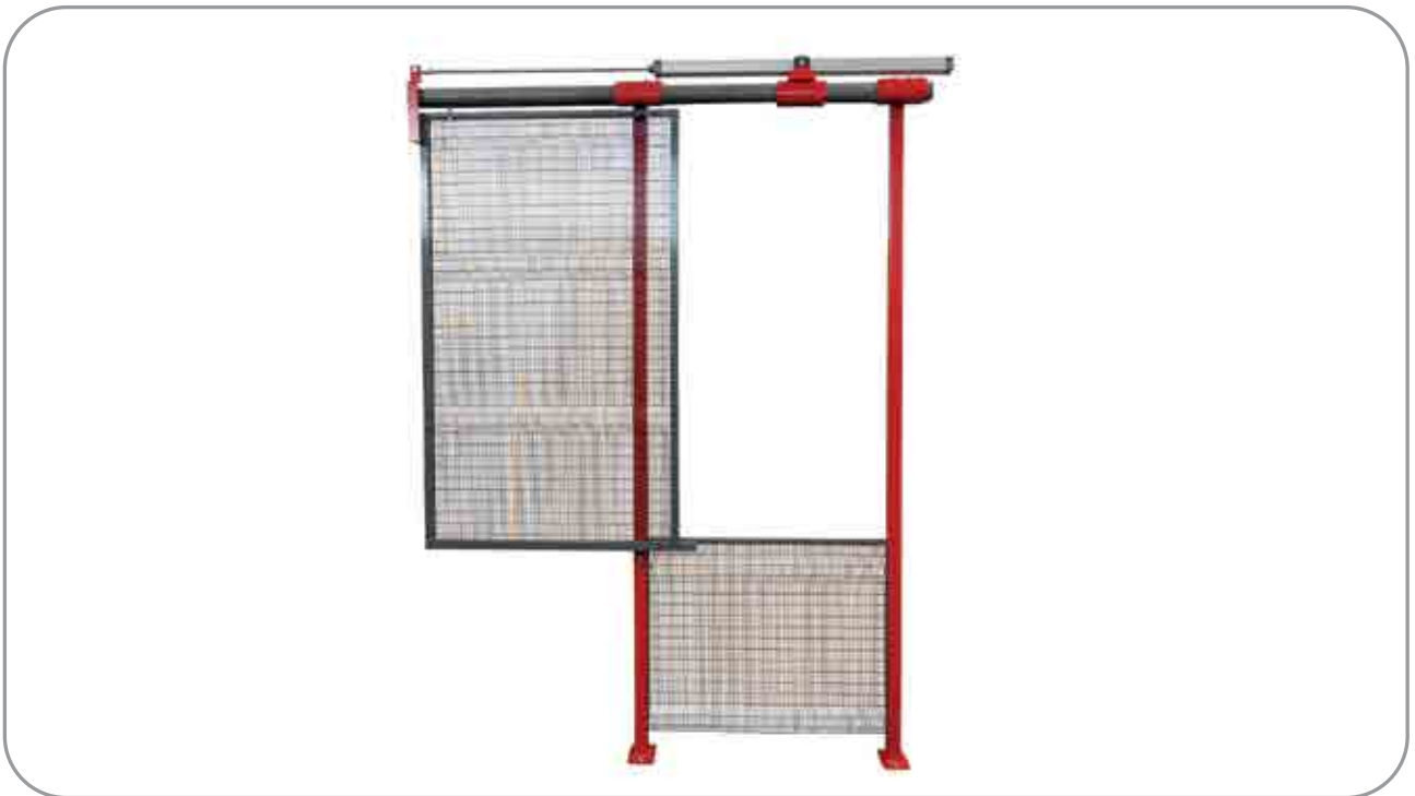
Special automatic gate with pneumatic cylinder