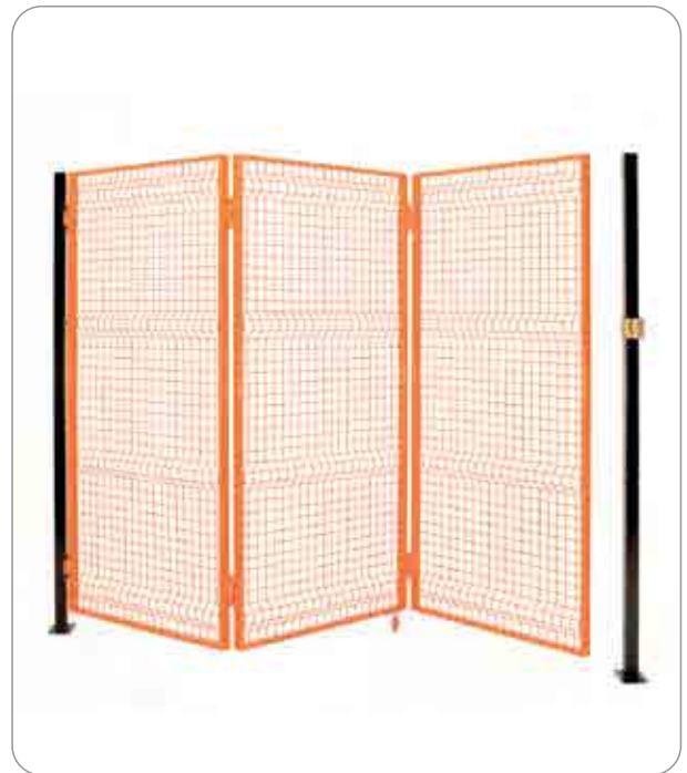
Folding gate with two or more panels