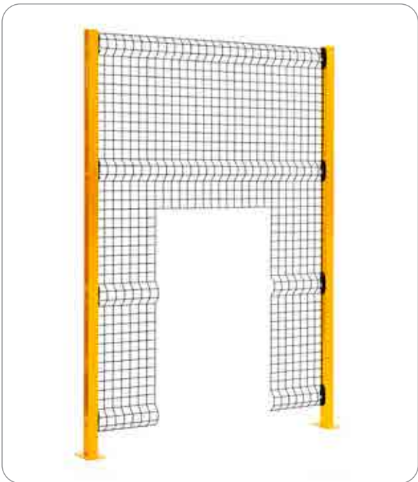
Panel with cut-out