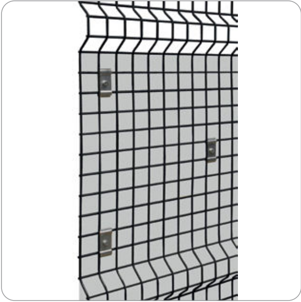
Polycarbonate applied with brackets, code 109