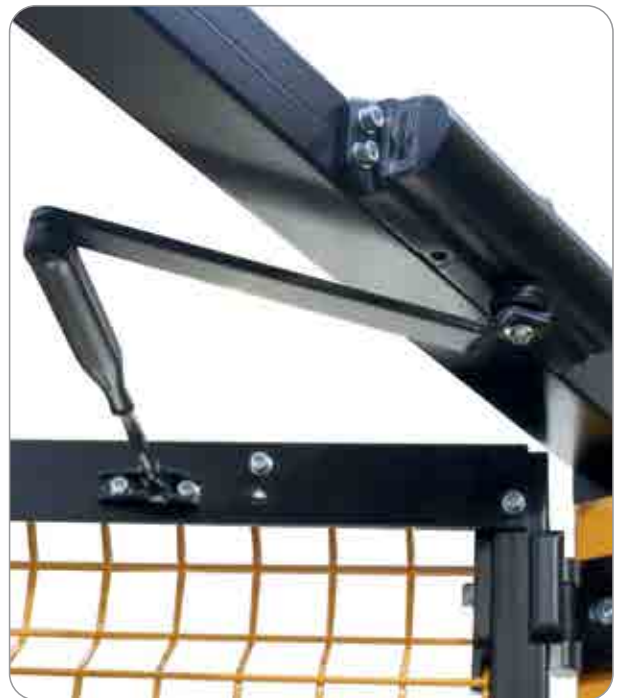
Automatic closing spring for hinged gate