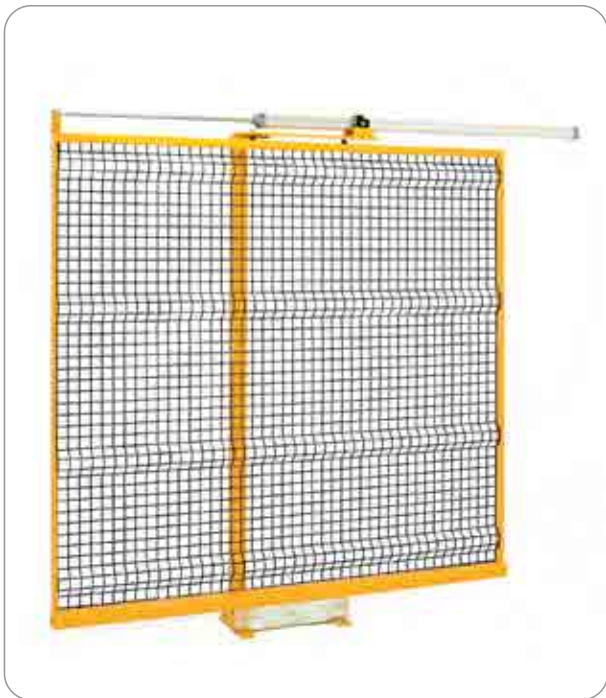
Automatic sliding gate with pneumatic cylinder