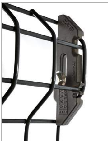
SKATTO plate - Captive fastening system in compliance with the Machinery Directive 2006/42/EC