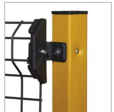
Hinge for angles other than 90^\circ